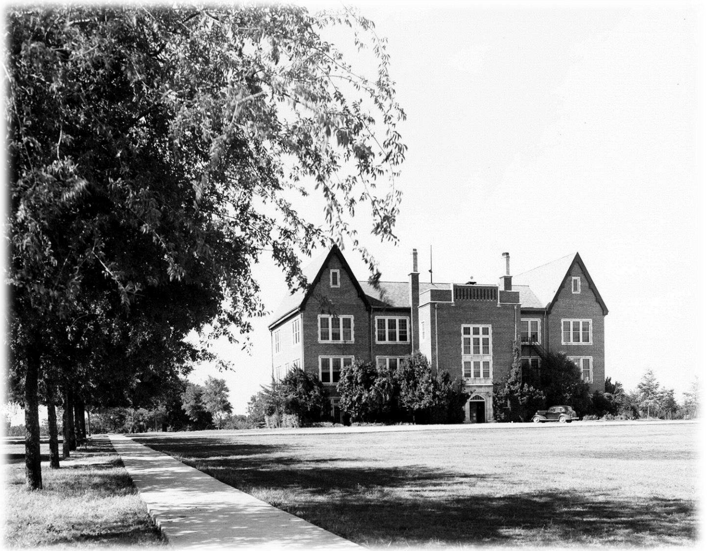
A snapshot of the Weir Academic Building taken during the 1940s on the grounds of Schreiner Institute.

Share the memories with us on social media. #Leavewithachievement